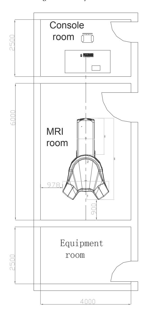
Fig 1 : 6 x 4 m Layout