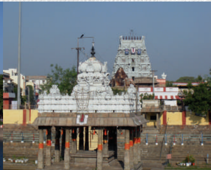
PARTHASARATHY TEMPLE THIRUVALLIKENI