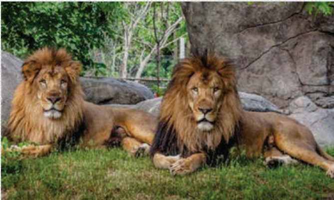
ANNA ZOOLOGICAL PARK