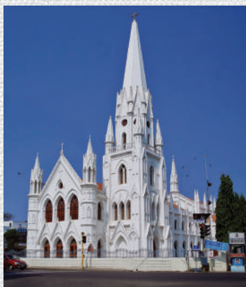
ST. THOMAS CATHEDRAL BASILICA